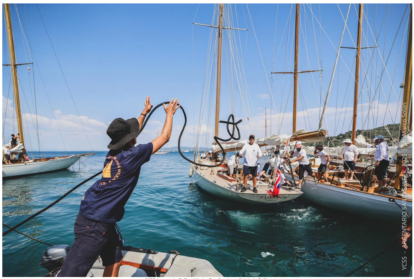
2025 Argentario Sailing Week - Day 0