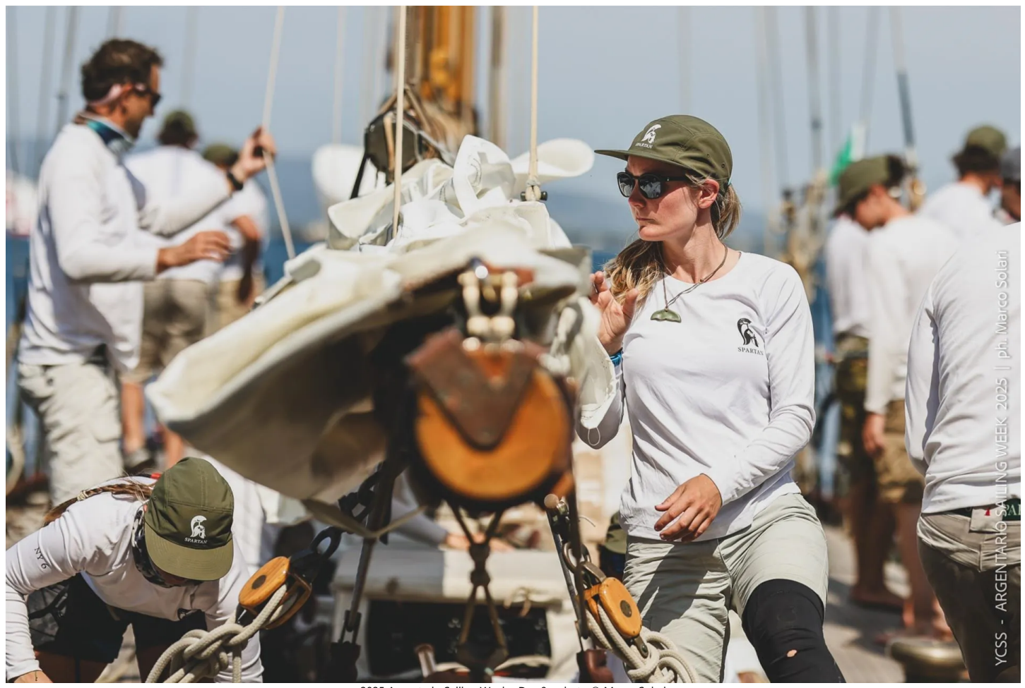
2025 Argentario Sailing Week - Day 0 - photo © Marco Solari