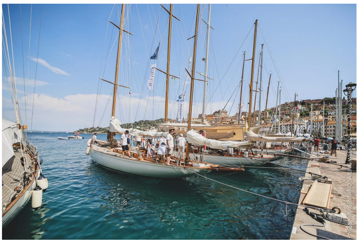
2025 Argentario Sailing Week - Day 0