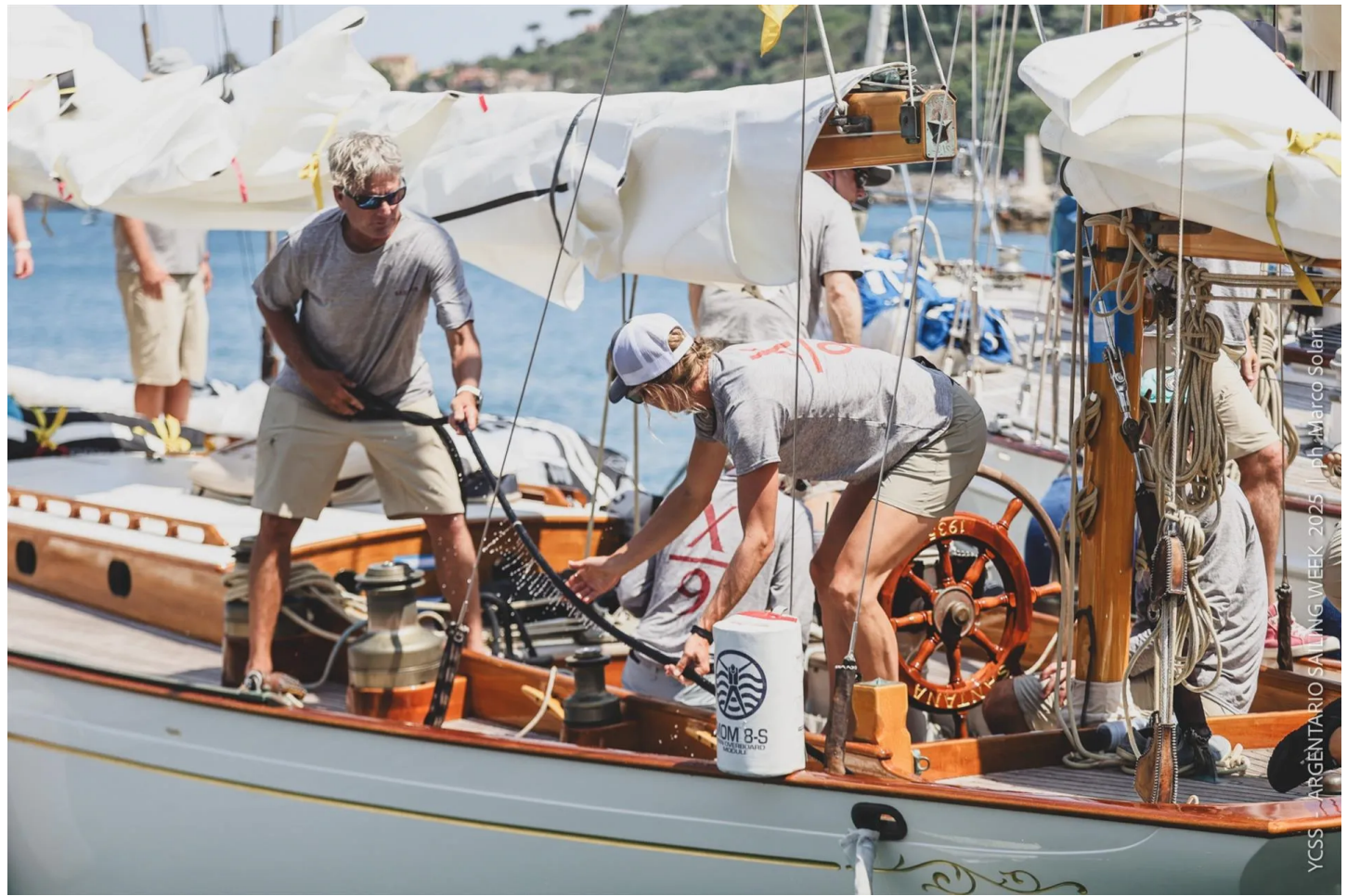
2025 Argentario Sailing Week - Day 0

The Argentario Sailing Week is one of ten regattas part of the 2025 International Mediterranean Classic Yachting Committee Championship (CIM)